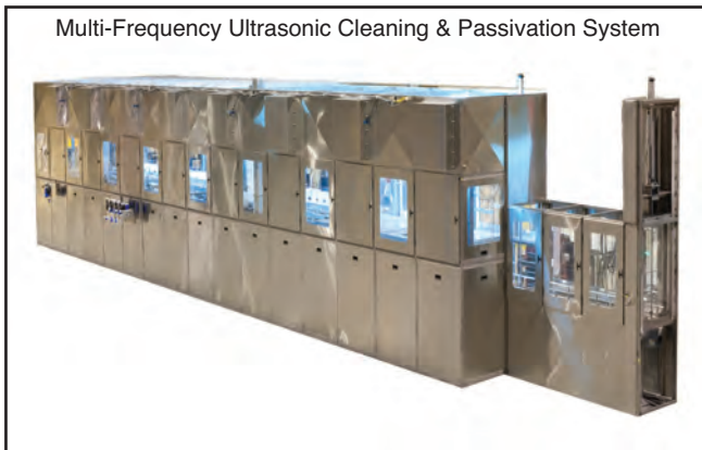
Multi-Frequency Ultrasonic Cleaning & Passivation System

Cleaning Technologies Group is a global supplier of the most innovative industrial and precision cleaning technologies available today. The company is comprised of three divisions, Blackstone-NEY Ultrasonics , Ransohoff , and CTG Asia . Our team has the process knowledge and capability to meet your specific needs and the experience required to help you make an educated cleaning equipment purchase. In addition, the company is leading the way with waste minimization products and machines that are highly energy efficient, which allow for recycle and re-use of the cleaning liquids.